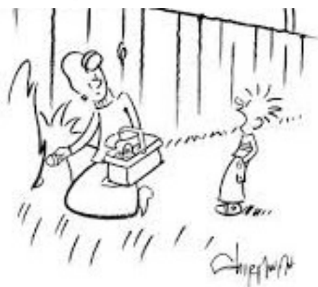
"Why don't we hide the broccoli instead of the eggs?"

Course Closed Sunday 30th March 10am to 3 pm Due to Mens Pennant