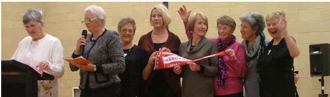
Wangaratta Division 2 receive their Pennant Flag at the Dinner